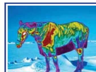
With Arctic Blast